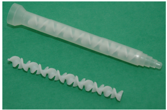
Figure #6 Helical Plastic Disposable Static Mixer with/without housing.

For difficult meter-mix dispense applications, please refer to our technical information sheet on page 1 Fig.#2,#3 and #4.